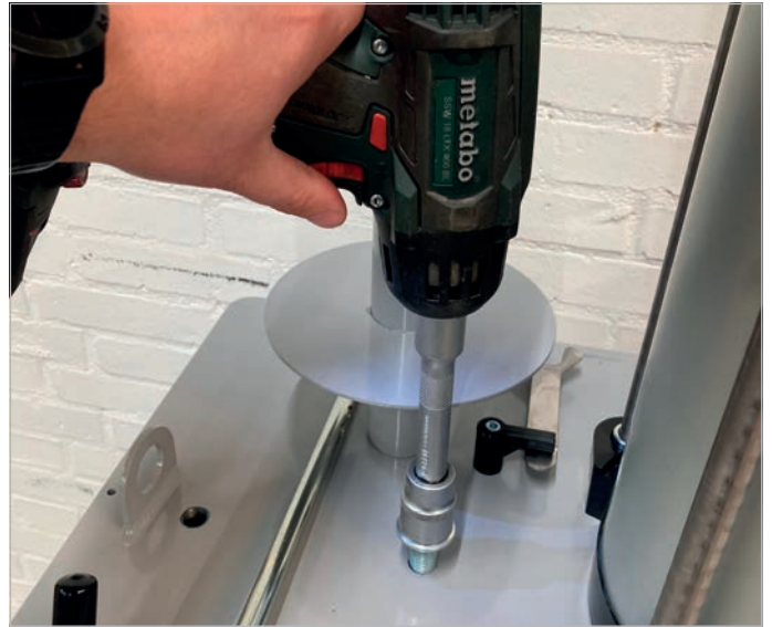
10. Mount "Plug" bolt left.