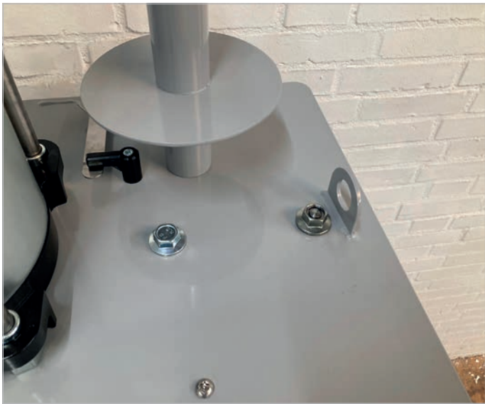
13. Right side look like this.