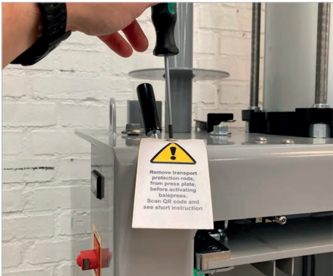
15. Remove block for "P" pos. with TX15 tool.