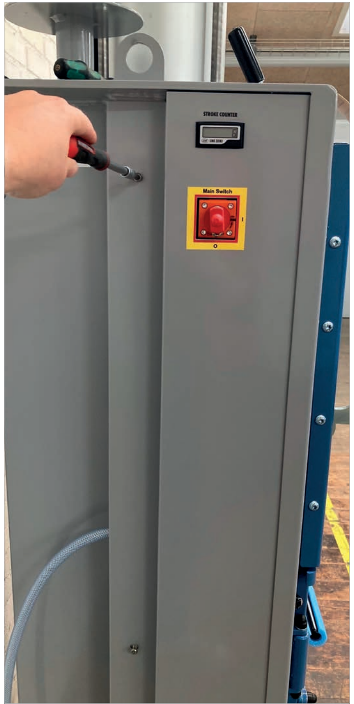
22. Mount the left side cover.

Machine is now ready for operation (if machine is installed according to manual "Transport and installation")