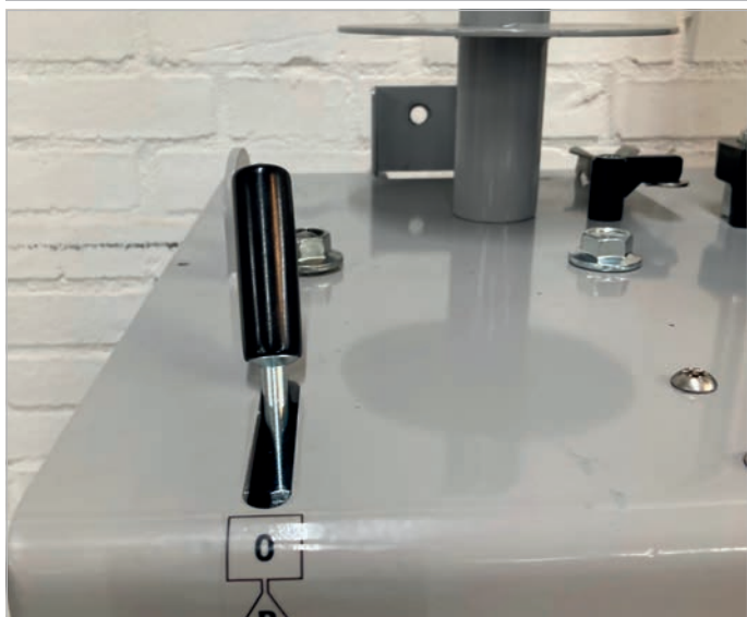
17. 3 pos. school look like this.