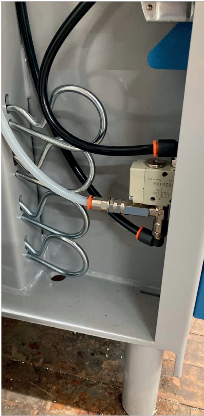
21. The 2 split pins are placed at storage holes left.