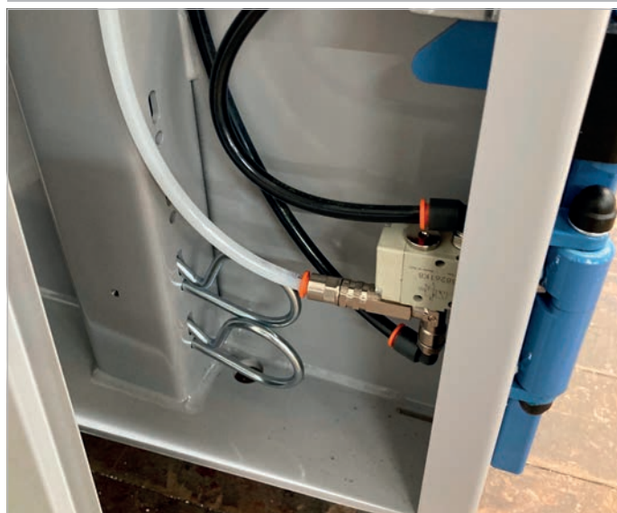
20. The 2 split pins are placed at storage holes left.

A102/A205 Removing transport protection rods from press plate