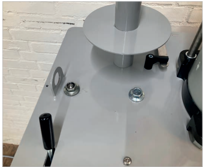
14. Left side look like this.