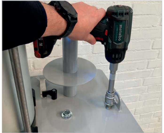
12. Mount transport bolt in storage pos. right.

A102/A205 Removing transport protection rods from press plate