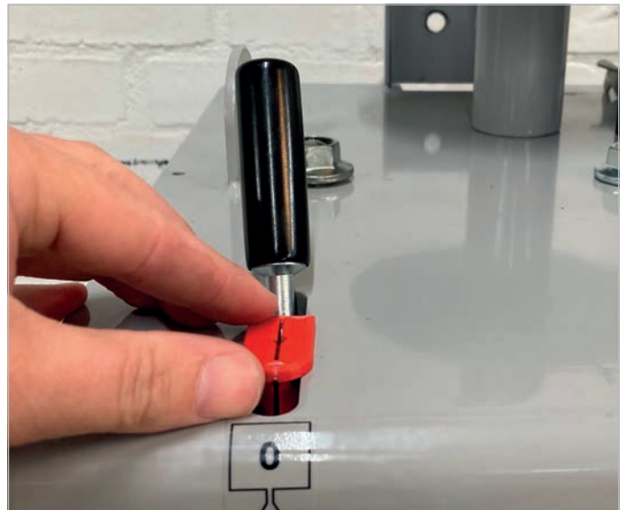
16. Remove the red block for "P" pos.