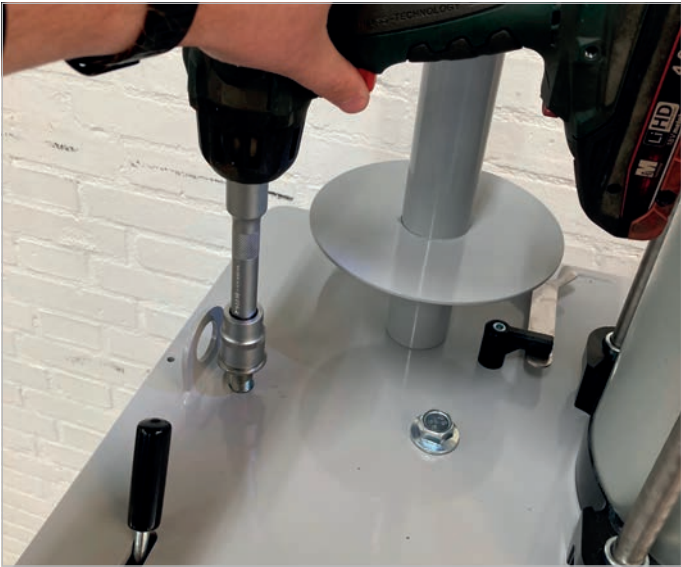
11. Mount transport bolt in storage pos. left.