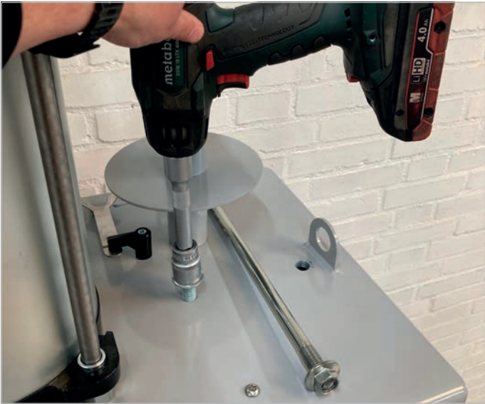
9. Mount "Plug" bolt right.