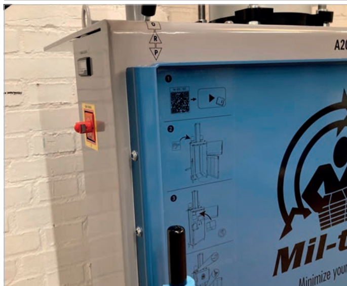
18. Close the top door at put the machine into press.